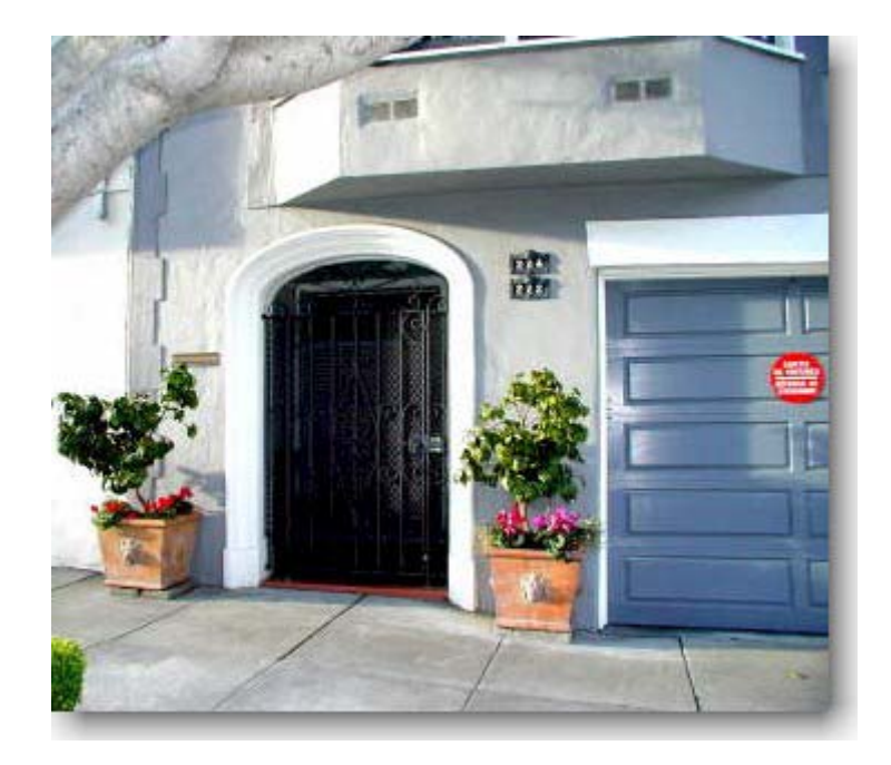
How to Find Us

If you are coming to our house, here are some detail maps of San Francisco and directions to help you find us.